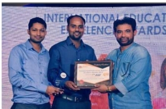
Awarded By Ex-Indian Cricketer Chetan Sharma Sir