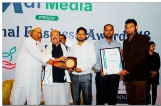
Awarded By Ex-Indian Cricketer Sandip Patil Sir