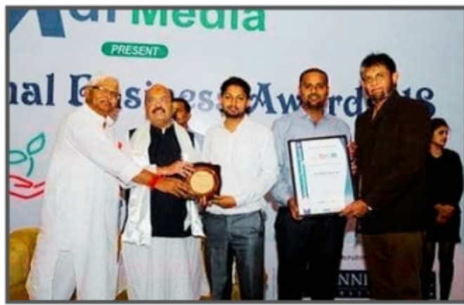
Awarded By Ex-Indian Cricketer Sandip Patil Sir