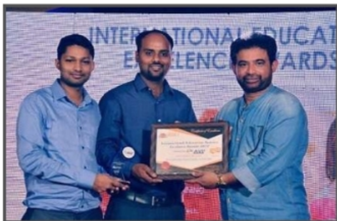
Awarded By Ex-Indian Cricketer Chetan Sharma Sir